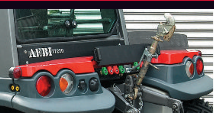
Strength and pulling power at the rear