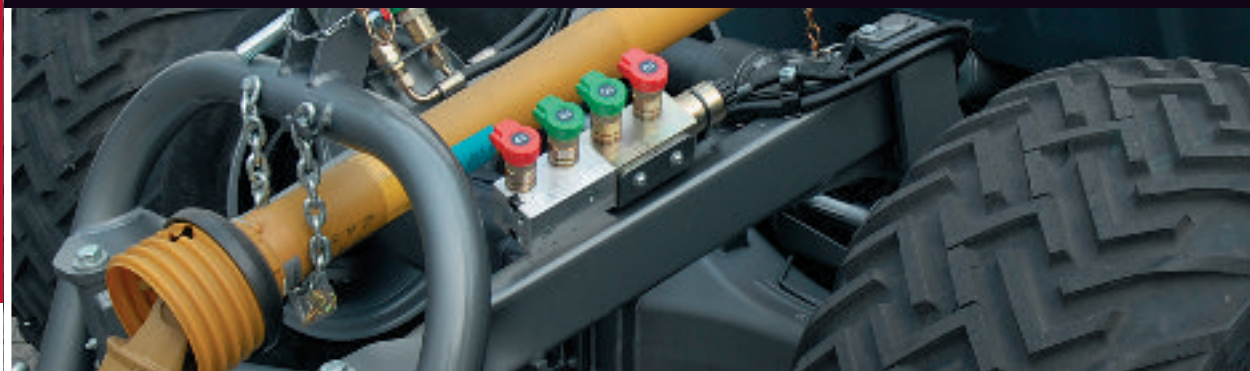
Hydraulic connectors on the front hydraulic lift