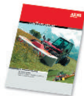
In the Terratrak general brochure, you can read all about the Terratrak operating concept, the application of state-of-the-art electronics and the unrivalled automated features.

External push-buttons allow easy operation of the front and rear hydraulic lifts for fitting attachments. The front hydraulic lift can be moved to the side. At the rear, there is also a height-adjustable trailer coupling.